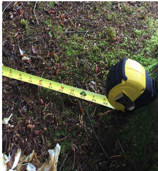
Image 4. Close-up of measurement