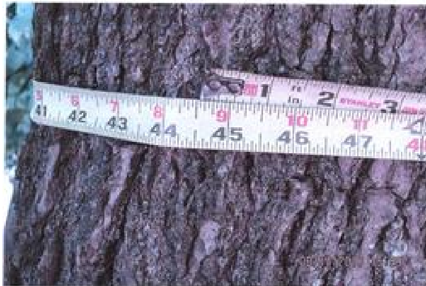
Image 2. Tree Trunk Measurement