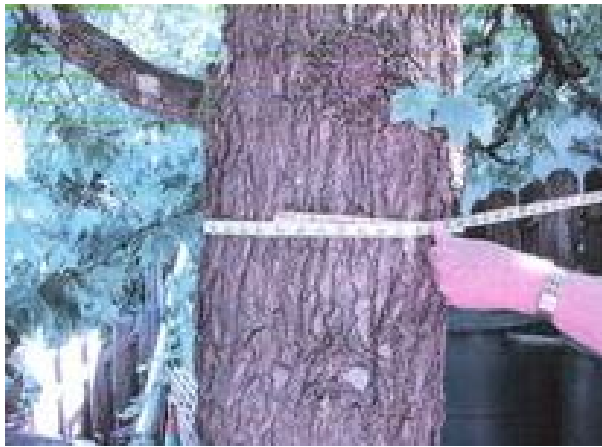
Image 1. Tree circumference at 4.5 feet