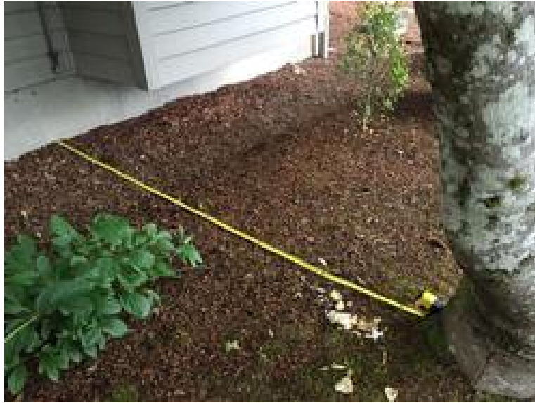
Image 3. Distance from building to private tree